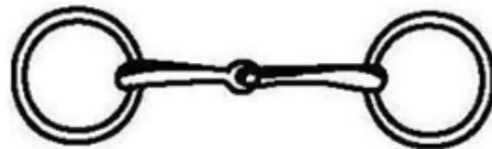
O-RING SNAFFLE BIT