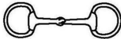
EGGBUTT SNAFFLE BIT

*Photo below depicts acceptable snaffle bits for horses 5 and under. Photo is of a few examples, but the rule is not limited to the examples below.